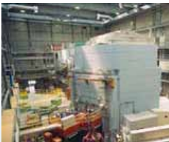
The neutron spallation source SINQ at PSI

NEUTRA and ICON neutron imaging beam lines / Wide range of detector options Mobile fuel cell test bench for experiments in the beam lines / For specific projects: ECL setup for simultaneous imaging of 6 fuel cells