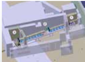
The neutron imaging beam line ICON