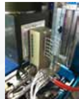
The ECL setup for simultaneous operation and imaging of 6 fuel cells, in the ICON beam line

High resolution imaging of water distribution in an operating PEFC (false color representation)