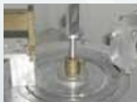
X-ray fluorescence and Compton scattering spectrometer