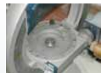
High energy four circle x-ray diffractometer