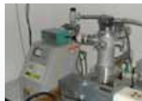
Low temperature wide angle diffractometer