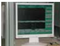
Fluorescence and Compton acquisition system

Four x-ray sources with monochromatic beams ranging from the Cr K \alpha wavelength up to the W k \alpha wavelength and continuous radiation up to 300 keV photon energy. Wide range of sample temperature from 10 K up to 1000 K for diffraction experiments, including Bragg and diffuse scattering. Appropriate devices to measure the Compton profile at 22 keV and 60 keV photon energy. Neutron analysis, microscopy techniques, light absorption techniques.